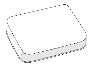
FIG. 2: Sew a heavy-gauge muslin breather strip along the back of the cushion where the zipper is located.

If you want the option of a reversible cushion, though with Crypton it is not necessary to rotate cushions, we recommend applying the breather strip approximately 3.5"-4" across the width of the bottom of the boxed portion on the back side of the cushion (Fig.2), also referred to as the bottom gusset. This method will also alleviate the issue of puckering and refill on a softer fill application with Crypton.